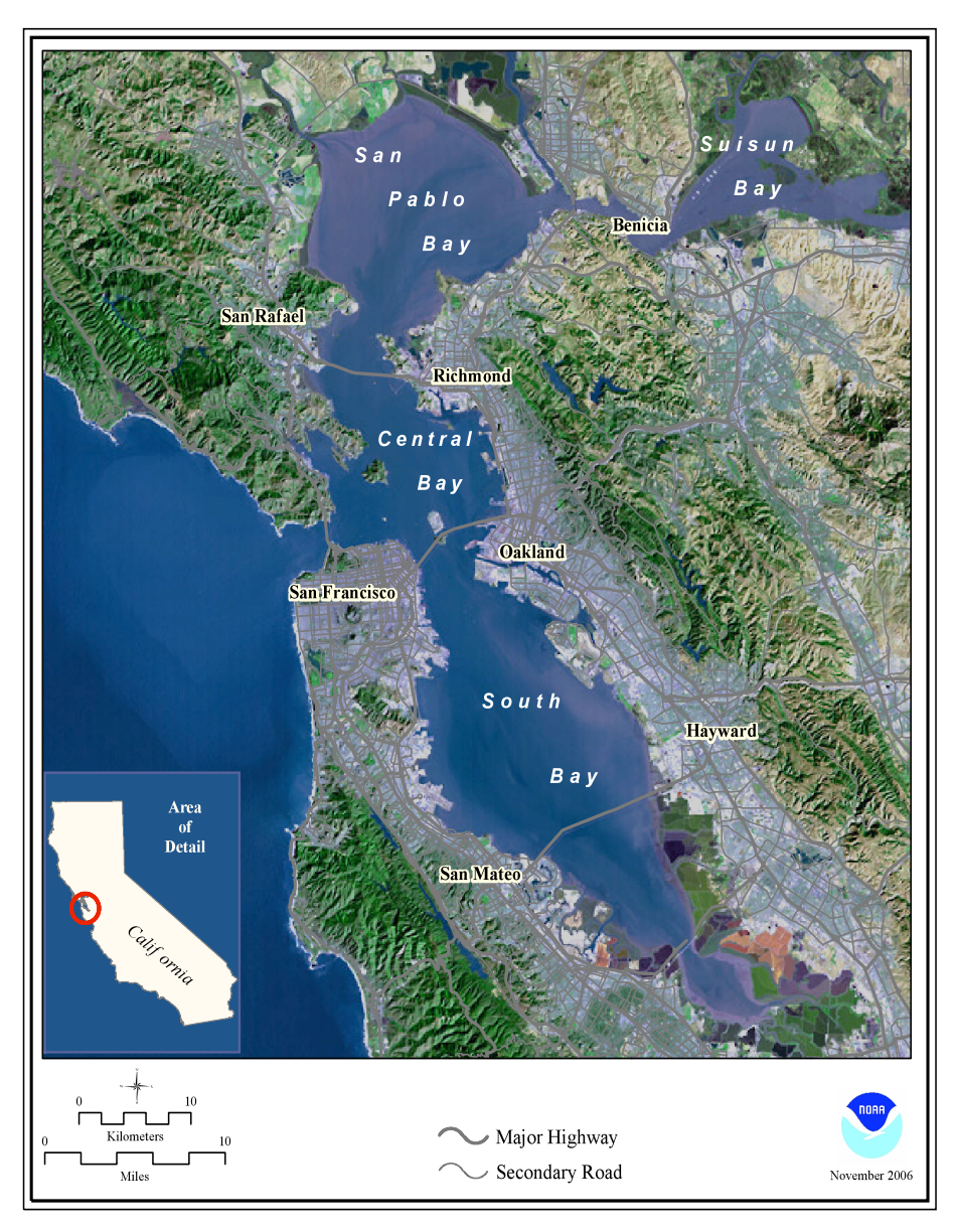
Figure 1. San Francisco Bay Subtidal Habitat Goals Study Area